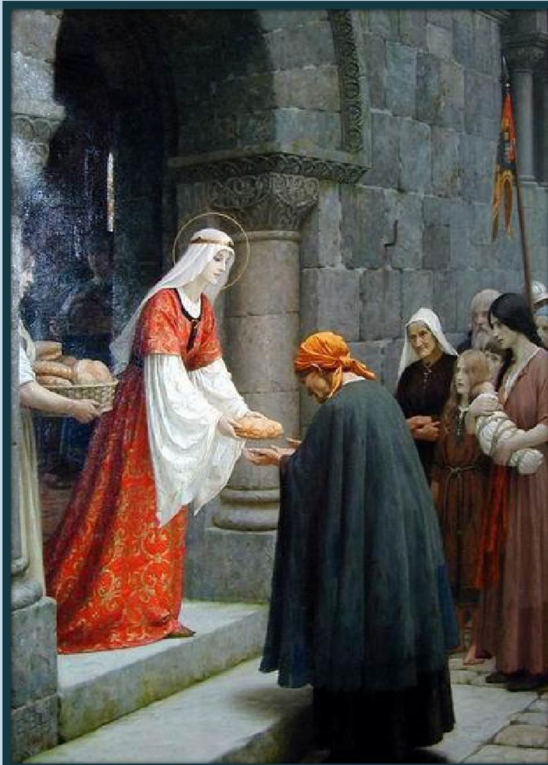
Saint Elizabeth of Hungary